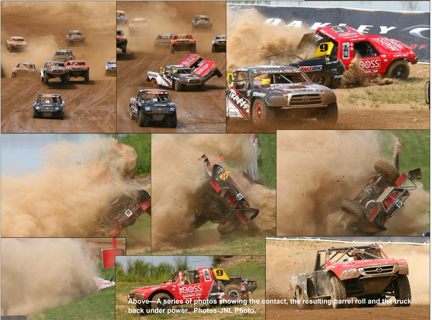
Above—A series of photos showing the contact, the resulting barrel roll and the truck back under power.