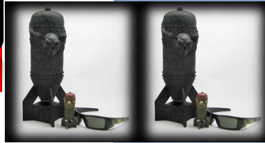
Oakley Bomb Run Awards for Fastest Lap of the Race:

PH: 906.246.3466 Cell: 906.282.0545 FAX: 906.246.3469 EMAIL: chad@hordracing.com Web: www.hordracing.com