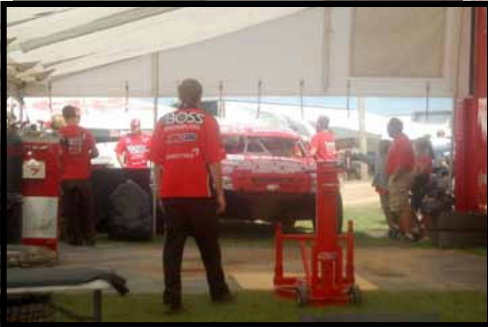
Above: Chad backing out, getting ready to go up to staging for the race.